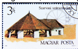
Horse driven mill in Szarvas, Hungary

baking of the bread and then concluded showing stamps with bread from all over the world. It was a thematic presentation, rather than a topical presentation which generated a conversation about the place in philately for topical and thematic exhibits.